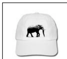
Sample products

Visit our website at: http://www.zamsoc.org